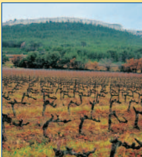
Roquefort la bédoule

(Hotel accommodations in Nice will be retained while you are in Provence.)